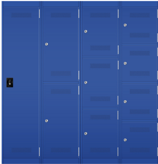
1 Door 2 Doors 3 Doors 4 Doors