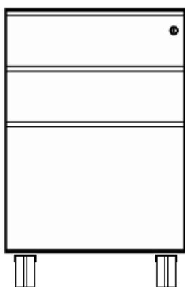
3 Drawer Combination

NOTE: All dimensions are nominal and subject to change without notice. Contact CSM to discuss customisable options.