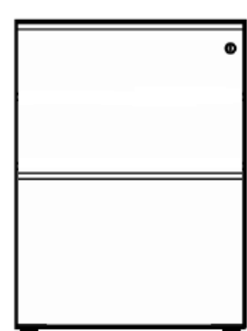
2 File Drawers on Gliders